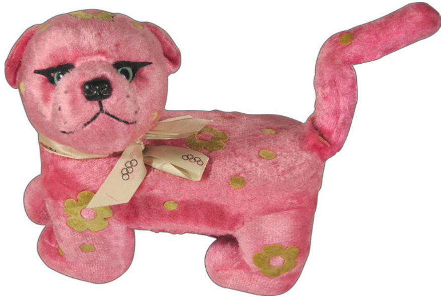
Lot 469 Chac Mool, a Jaguar, First Mascot of the Summer Olympic Games, Mexico City 1968